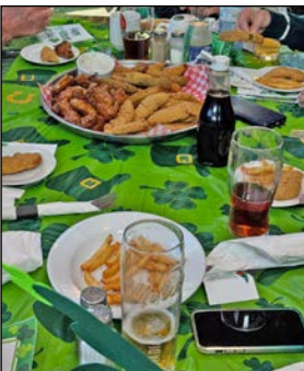
Delicious finger foods and lots of it, followed by a yummy cake for dessert.