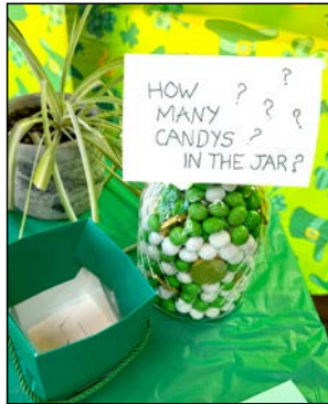
Count the candies in the jar.