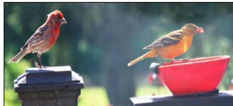
Mom shows up with one of the kids.