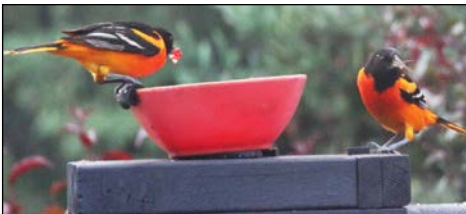
Fathers enjoying their dinner.