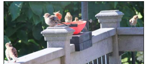
All the kids show up hungry!

July Whether you're seeking creative inspiration or simply looking to soak up some rays on a hot day, this month will surely leave you feeling charged and ready to take on anything!