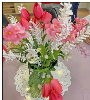
Table Decor to Celebrate Mother's Day